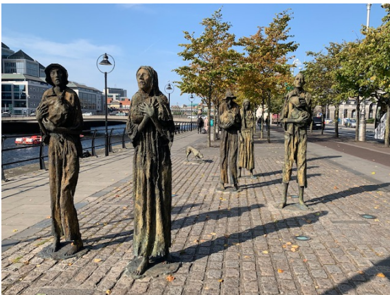
Famine Memorial on the North Quay, Dublin: this memorial attracts many visitors from around the world.